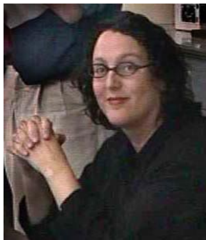
Best-selling author and instructor Lynda Weinman demonstrated Dreamweaver 3 and Fireworks 3 at SBMUG's December meeting.